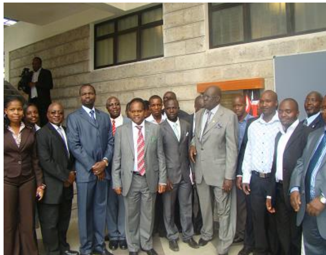
During the opening of the new Science Complex and Lecture Theatre on 15 th September 2011